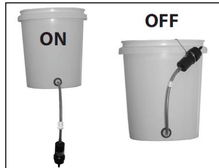
Sawyer Filter Operation