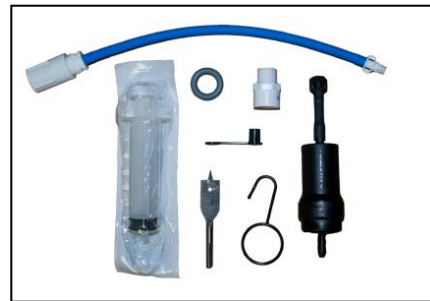
Sawyer PointOne™ Filter Kit

Lifespan: No field data available yet to estimate how long the filter will remain useable.