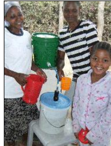
Sawyer PointOne™ Bucket Filter

Maintenance: Need to backwash filter using syringe provided in the kit when flow rate slows down. With relatively clear inlet water, backwashing is recommended every 3,800 litres. If inlet water is extremely turbid, backwashing is recommended every 40 litres or less.